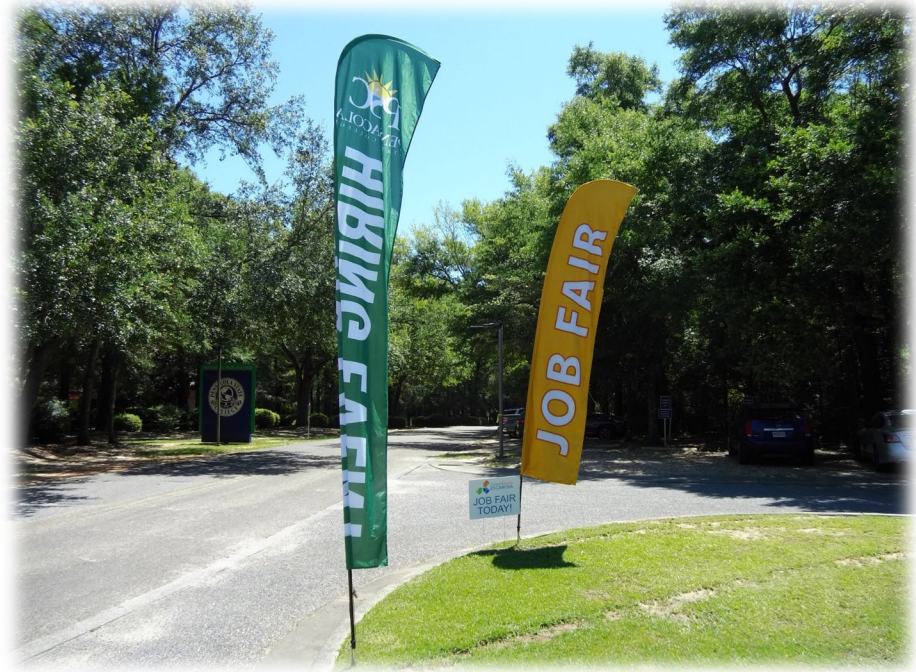
PSC Milton Campus Job Fair